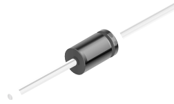
DO-35 Color Band Denotes Cathode