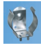
PC Battery Clip Available See Page 11.