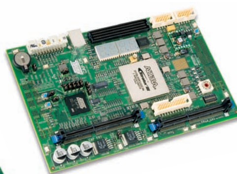
CAP9HA Mezzanine Board