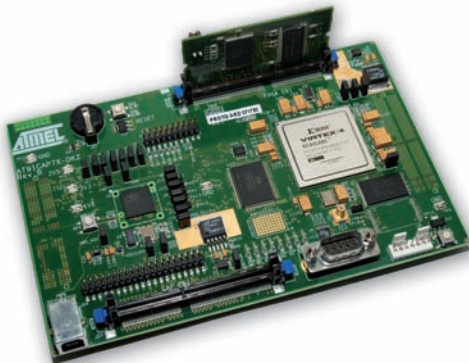
CAP7X Mezzanine Board