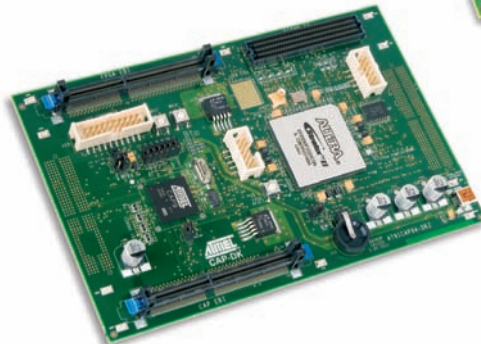
CAP9A Mezzanine Board