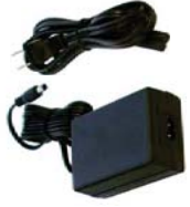
Power Supply & Cord