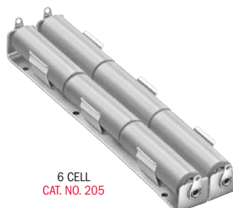
6 CELL CAT. NO. 205