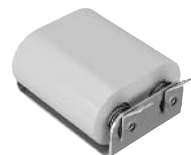
CAT. NO. 223