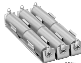
6 CELL CAT. NO. 193 CAT. NO. 197