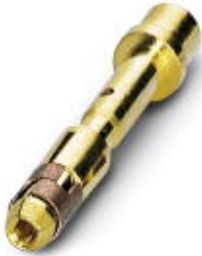
Crimp contact, turned, Single contact, Contact diameter: 1 mm, Crimp range: 0.06 mm 2 ...0.25 mm 2

Please be informed that the data shown in this PDF Document is generated from our Online Catalog. Please find the complete data in the user's documentation. Our General Terms of Use for Downloads are valid ( http://phoenixcontact.com/download )