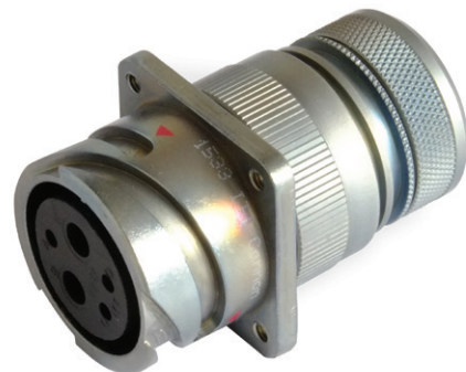
Blue Generation Plating (A240)