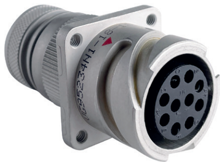
J Plating (A241)

ITT Cannon's Blue Generation Plating This ruggedized RoHS compliant industrial plating delivers an outstanding combination of extreme durability, conductivity and shielding performance. • Salt spray resistance: 500 hours • Shielding effect acc. VG 95373: >65 dB • Conductivity: <10 mOhm • Zinc nickel plating chemistry • RoHS and REACH compliant