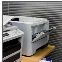
Copiers and Printers