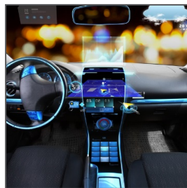
Automotive Interior Lighting and Sound System