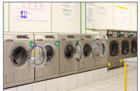
Laundry Equipment (washers and dryers)