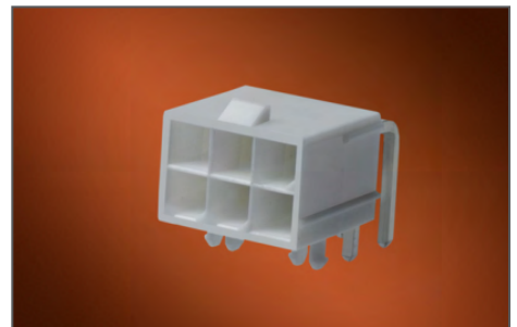
Mini-Fit® Plus Header