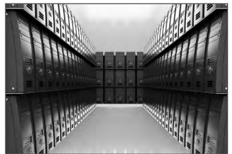
Server and Storage Room