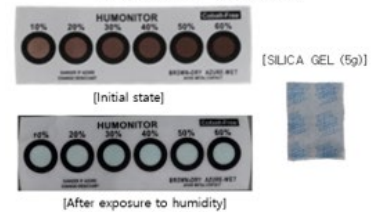
[SILICA GEL (5g)]