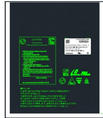
[MBB BAG drawing]