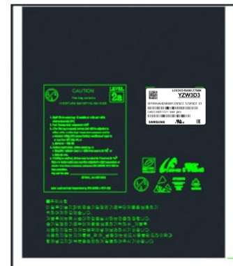
[MBB BAG drawing]