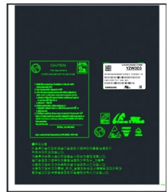
[MBB BAG drawing]