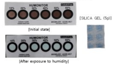
[SILICA GEL (5g)]