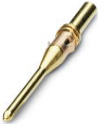
Crimp contact, turned, Contact diameter: 1.5 mm, Crimp range: 0.75 mm 2 ...1 mm 2

Please be informed that the data shown in this PDF Document is generated from our Online Catalog. Please find the complete data in the user's documentation. Our General Terms of Use for Downloads are valid ( http://download.phoenixcontact.com )