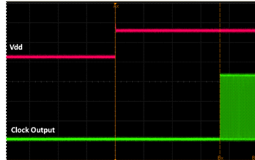
Figure 17. Startup Waveform vs. Vdd

In addition, the SiT1602 features “no runt” pulses and “no glitch” output during startup or resume as shown in the waveform captures in Figure 17 and Figure 18.