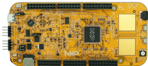
S32K144EVB EVALUATION BOARD