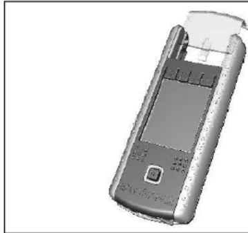
Figure 1. EvoPrimer base