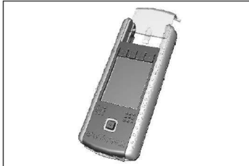
Figure 2. EvoPrimer target boards