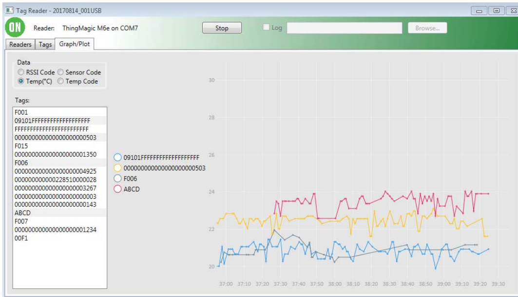
Figure 5. Sensor Information Displayed Under "Graph/Plot" Tab

The second way to view data is by setting up a Log File using the "Browse" button at the top of application and checking the "Log" checkbox. This will dump all the information collected during the session to a logfile including EPC, sensor code, timestamp, etc.