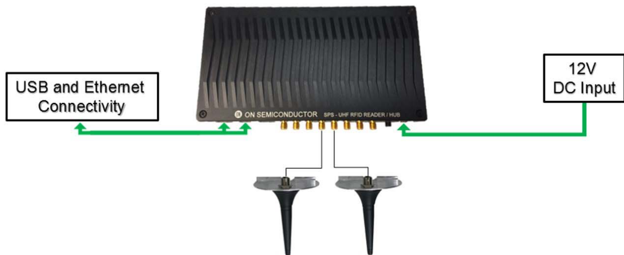
Figure 2. SPSDEVK1MT-GEVK Hardware Setup