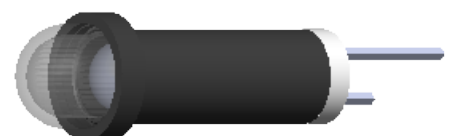
ISOMETRIC VIEW ONLY FOR REF.

The information in this document is the exclusive PROPRIETARY property of VISUAL COMMUNICATIONS COMPANY, LLC . It is disclosed with the understanding that acceptance or review by the recipient constitutes an undertaking by the recipient: (1) to hold this information in strict confidence (2) not to disclose, duplicate, copy, or use the information, in whole or in part, for any purpose other than that for which disclosed