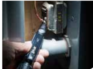
High sensitivity mode for low voltage systems like doorbell transformers