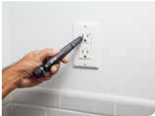
Detect voltage quickly and easily