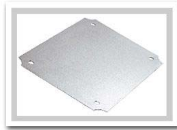
Click on Image for Larger View

Aluminum Internal Panels for AN series boxes. Used to mount customer equipment inside the enclosures. Assembles to mounting bosses on inside of enclosure.