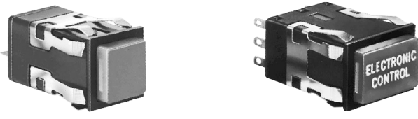
Buttons ordered separately.