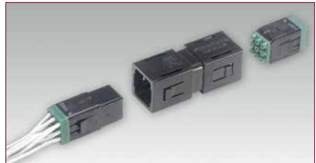
LMS Tool-less Splice Connector